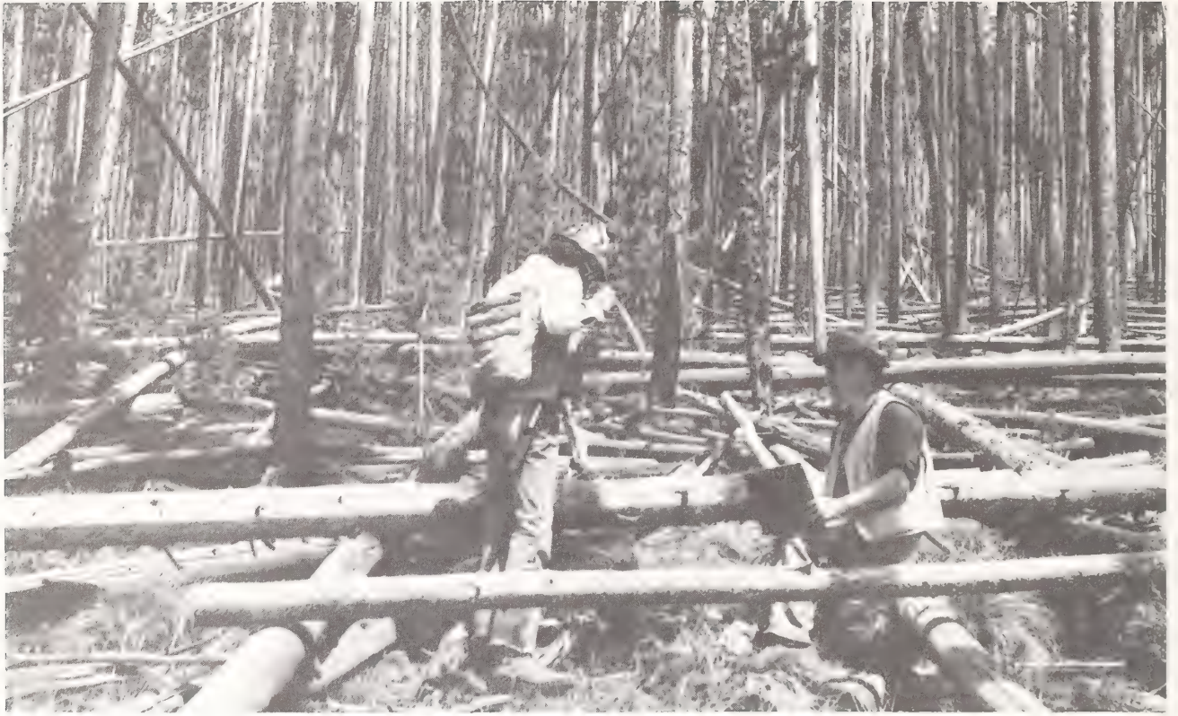
Figure 3.--Field crew evaluating product potential. Much of the standing green timber and larger down dead pieces are suited for houselogs or saw logs. Smaller pieces like the one in the foreground are suited for rails, posts, or fiber products.

To further define utilization potential, the types of products that could be made (fig. 3) from lodgepole pine were estimated. This evaluation was mostly quick, visual appraisal, but should provide a reasonable estimate product potential. On the down material, species was not always identifiable, so the summary includes all stems. For the standing trees, only lodgepole pine is included because we assume that alpine fir, spruce, and so on would not be used for roundwood products. In evaluating the trees, field crews were instructed to estimate potential roundwood products, first houselogs, then corral rails, and last, fenceposts. Specifications (minimums) were as follows: